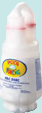
7 lb. Chlorine Pac

• POOL FROG® is the only mineral system with a pre-filled chlorine pac that meets the EPA requirements to lower previously approved safe chlorine levels by up to 50%.