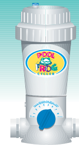
In Ground Mineral System