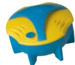
INSTANT FROG® Mineral Sanitizer for In Ground Skimmers