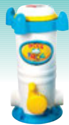
Above Ground Mineral System