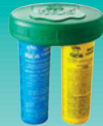
Floating Mineral System Floats in Any Spa