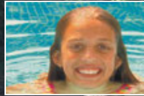
PREVENTS RED EYES