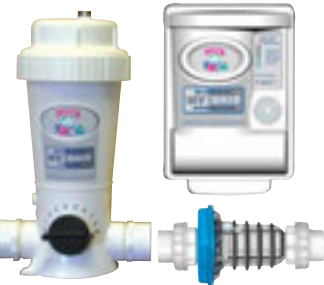
Mineral Hybrid Combines Benefits of 2 Technologies for Complete Pool Care