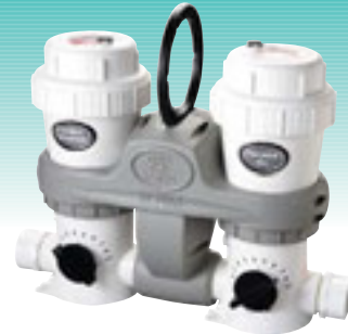
XL PRO In Ground System with X-tended Pac Life