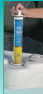
In-Line Mineral System Built In by the Spa Manufacturer for New Spas